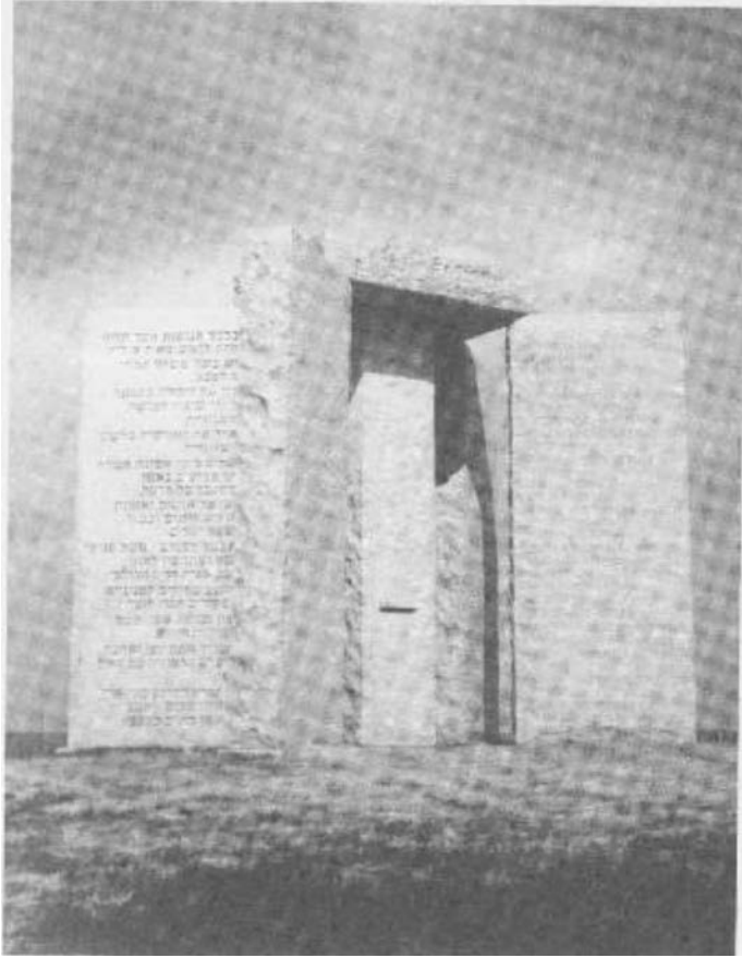
The Georgia Guidestones