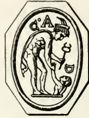
HERMES RESURRECTING THE DEAD.

Italy. Here the connection of Hermes with the restoration of life is most apparent, and for this reason he confers with the Chthonic Aphrodite. She stretches out her arm apparently granting his request for the resurrection of the dead, holding in her hands a pome-