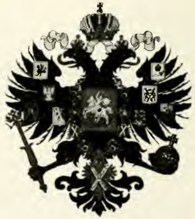
COAT OF ARMS OF RUSSIA.

The double-headed eagle, however, does not appear first as the emblem of the emperor. It occurs also in other coats of arms of minor significance. The first mention of it in heraldic books is in the illustration of the seal of the Count of Würzburg, dated 1202. Another is mentioned by Falme in his "History of Rhenish Families."* It was also the coat of arms of Henricus de Rode, dated 1276. Among the other double-headed eagles of an ancient date is one of 1278 which was borne by Philip of Saxony, and another by the Archbishop of Cologne, an evidence of which is its appearance upon the coat of arms of the city of Cologne. At present there are two little principalities which still bear the double eagle. One is