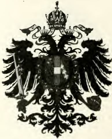
COAT OF ARMS OF AUSTRIA.

von Ludewig, Pfeffinger, and Samuel Oetler, but no satisfactory explanation has been offered as to the source and original meaning of the double eagle. Since the days of Emperor Sigismund, however, the emblem of the emperor has continued to be the double-headed eagle placed on a golden field, holding in its claws the scepter, sword and imperial globe. The two heads are surrounded by a halo. The breast of the double eagle always carried the coat of arms of the imperial house. The double eagle has been explained by lovers of mysticism as designating the double nature of the Roman Empire in both its spiritual and secular aspects at once. The Roman Church represents the spiritual world and the imperial government the worldly affairs of this monarchy which tacitly claimed to be of a universal nature.