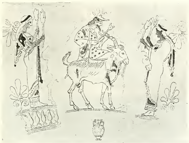
DESCENT OF DIONYSUS TO HADES.

In this connection we may also state that the famous staff of the Chthonic Hermes (Mercury) consisting of two intertwining serpents, is much older than Greek mythology. As some of the more archaic representations indicate, the staff consisted originally of the solar disk surmounted by a crescent, which is obviously a combination of the two symbols of the moon and the sun. It is not uncommon that a misunderstood symbol received a new interpretation by the after-thought of later generations that were not familiar with its history.