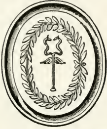
THE STAFF OF HERMES.

It is noticeable that in those representations of Hermes which refer to the funerary cult the old form is more rigorously adhered to, as appears, for instance, from a votive tablet found in Southern