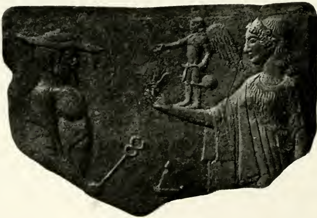
CHTHONIC HERMES. Votive tablet from South Italy.

Italy. Here the connection of Hermes with the restoration of life is most apparent, and for this reason he confers with the Chthonic Aphrodite. She stretches out her arm apparently granting his request for the resurrection of the dead, holding in her hands a pome-