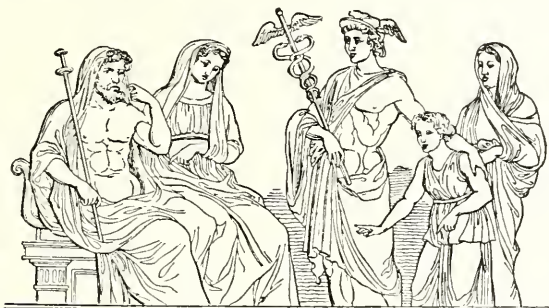
HERMES PRESENTING SOULS TO PLUTO AND PERSEPHONE.

The persistence of symbols is beautifully instanced in the double eagle and the staff of Hermes as well as the crescent and star of Turkey. But we ought to mention also the cross which has become the symbol of Christianity and yet it is as ancient as mankind. We have set forth this subject in a series of articles published some time ago in The Open Court and can only say that it is typical of the