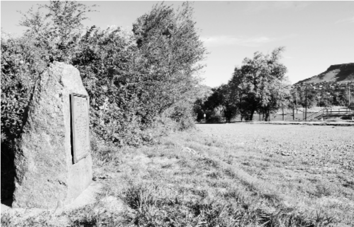
White Ash Mine Monument today; the School of Mines Stadium and Table Mesa are visible at right.

and the surrounding community to its knees in somber mourning. Standing at the site today, it's difficult to imagine the bustling White Ash Mine. But the mine — that fateful and terrible tomb — remains to this day, forever sealed within the earth,